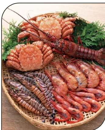
Prawn & Crab